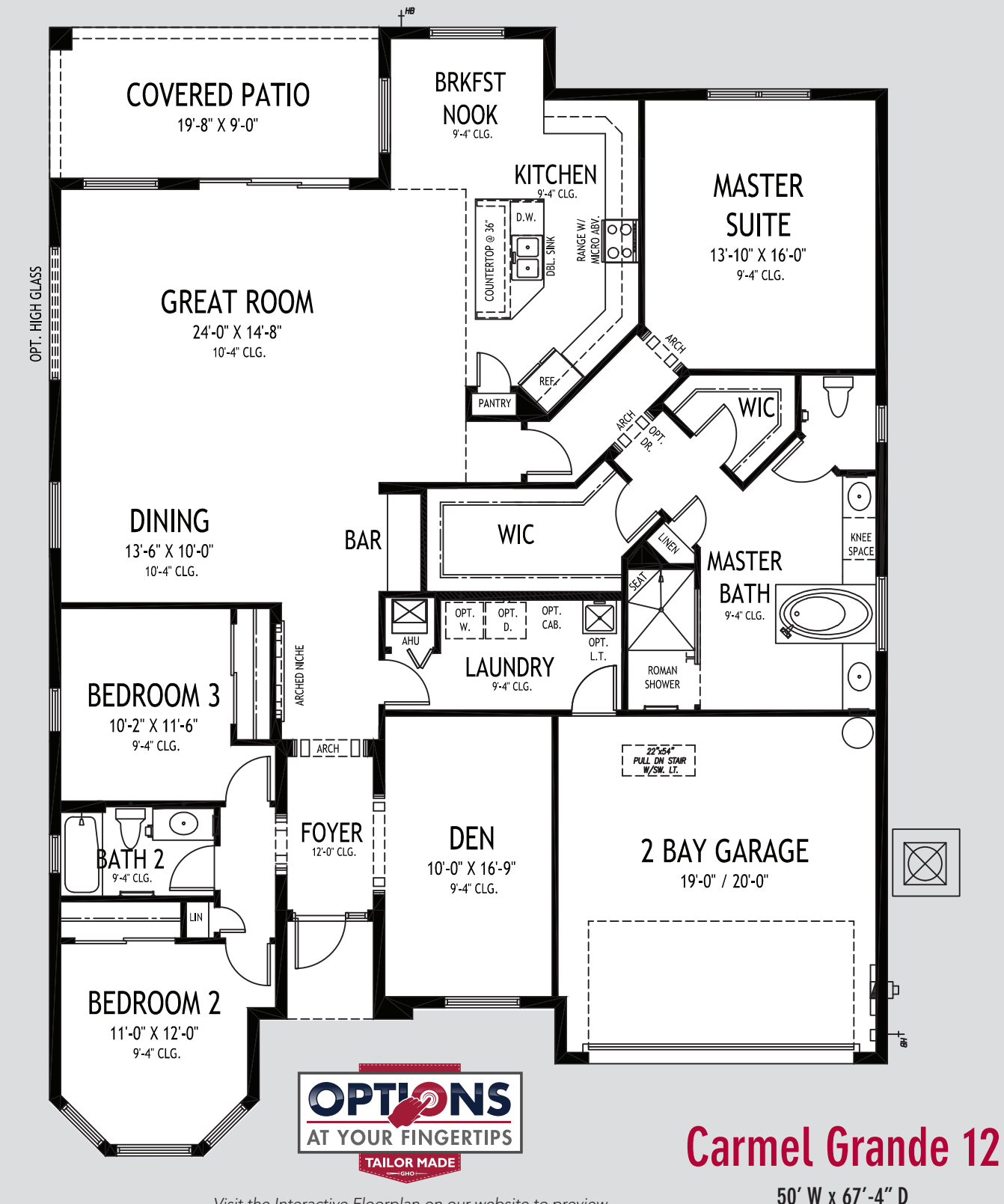
Visit the Interactive Floorplan on our website to preview options and make our house your dream home.