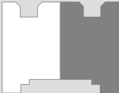
Typical attached villa